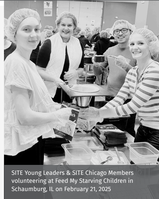
SITE Young Leaders & SITE Chicago Members volunteering at Feed My Starving Children in Schaumburg, IL on February 21, 2025